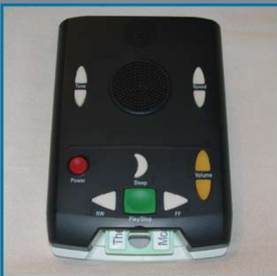
Talking Book Machine