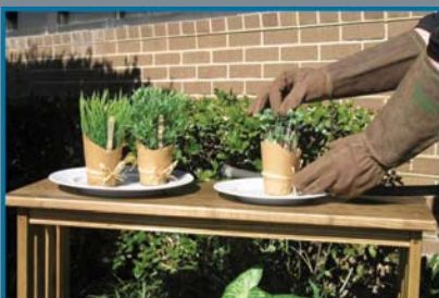
Container Gardening on an Easy-to-Reach Table

• Playing Cards and Board Games: Playing cards come in a variety of large-print sizes and contrasts, as well as in braille. Bingo cards are available in both large-print and tactile versions. You can buy braille and large-size versions of many popular board games, including Monopoly, Scrabble, checkers, backgammon, and chess.