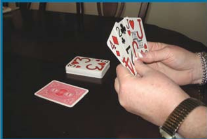
Large-Print Playing Cards