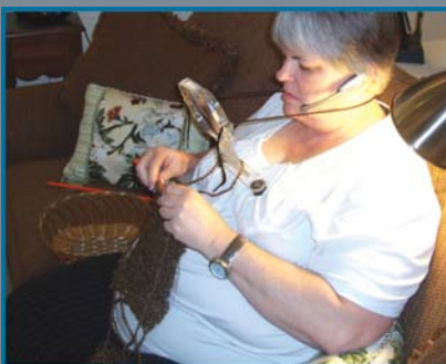
Knitting with Directed Lighting and Magnification